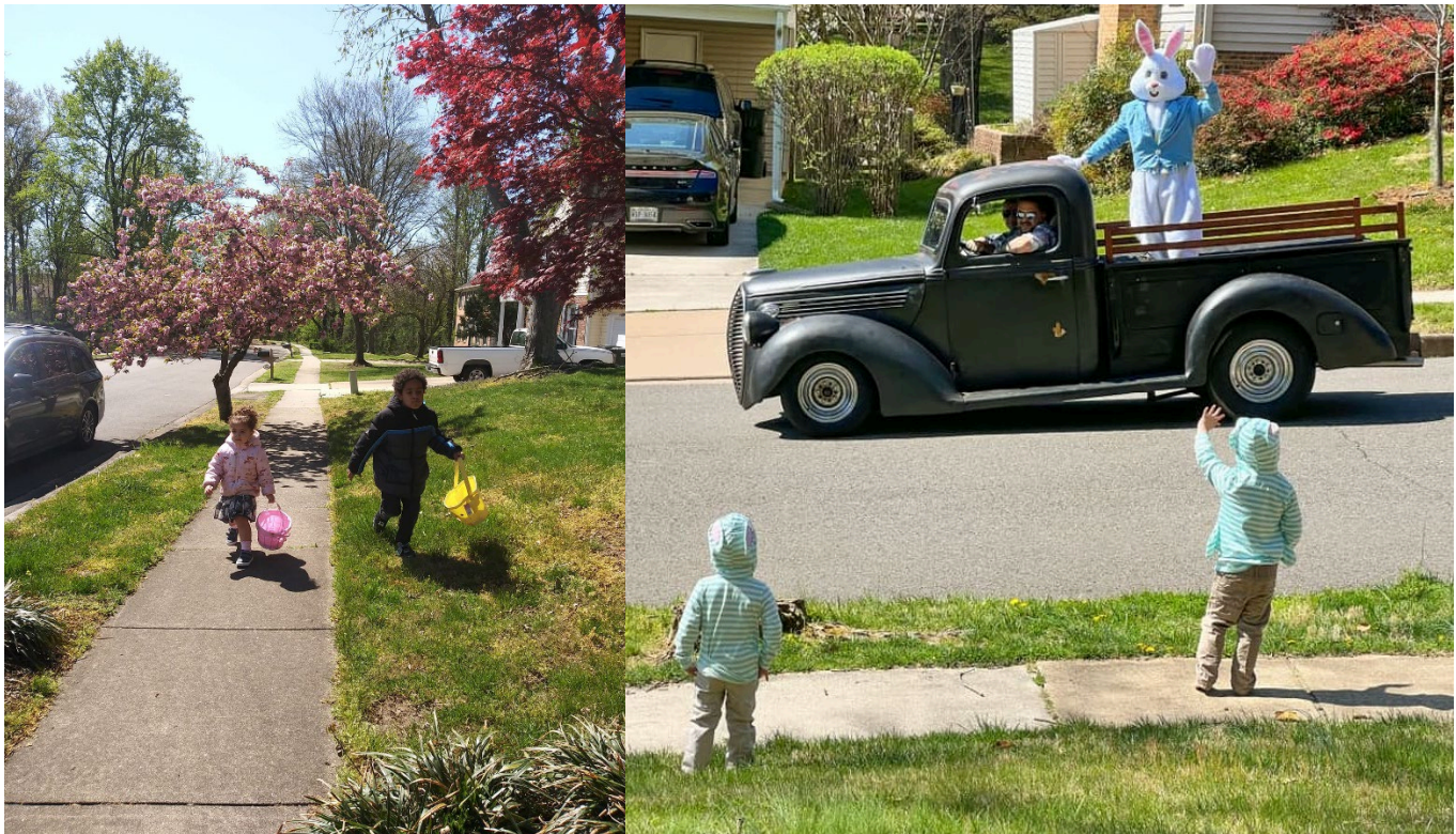
Residents searched for eggs and spotted the Easter Bunny

Did you catch a glimpse of the Easter Bunny hopping through Stoneybrooke? Residents reported sightings across the neighborhood, and children found eggs hidden in their yards. If you missed out, we hope you will sign up next year.