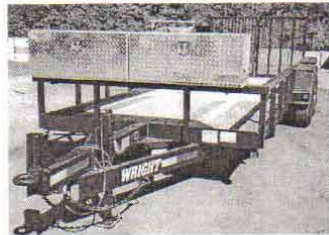
IF IT HAS YARD CUTTING EQUIPMENT ON IT