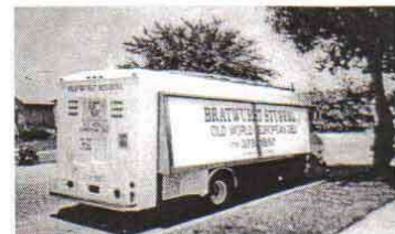
FOOD SERVICE VEHICLE