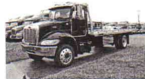
IF 12,000 LB OR MORE